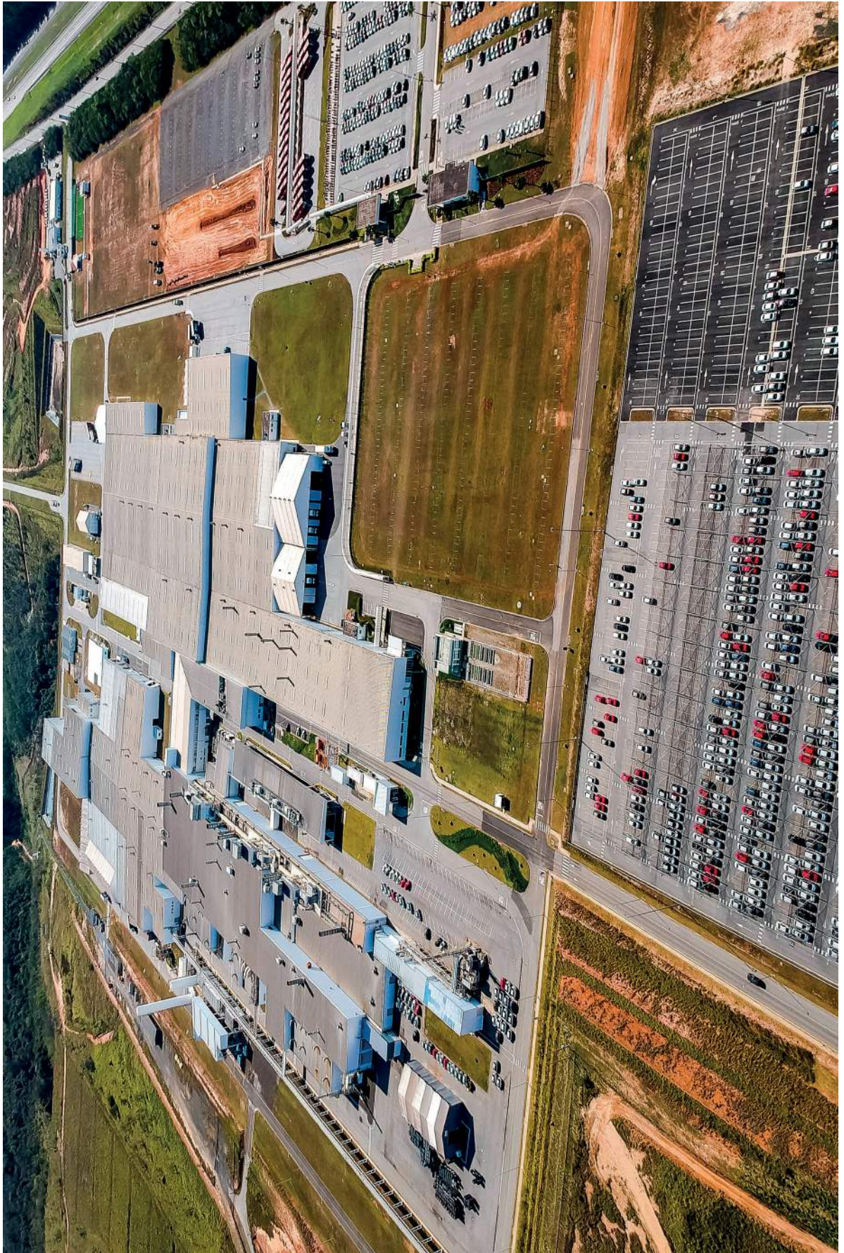
Fig. 3.1 for Question 3 A car manufacturing site in Brazil, an MIC in South America, in 2018